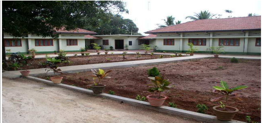
View of the Jaffna Hospice with the garden

Phone: Tel: 020 8548 0845 Mobile: 07740248908 E-mail: caneuk@hotmail.co.uk